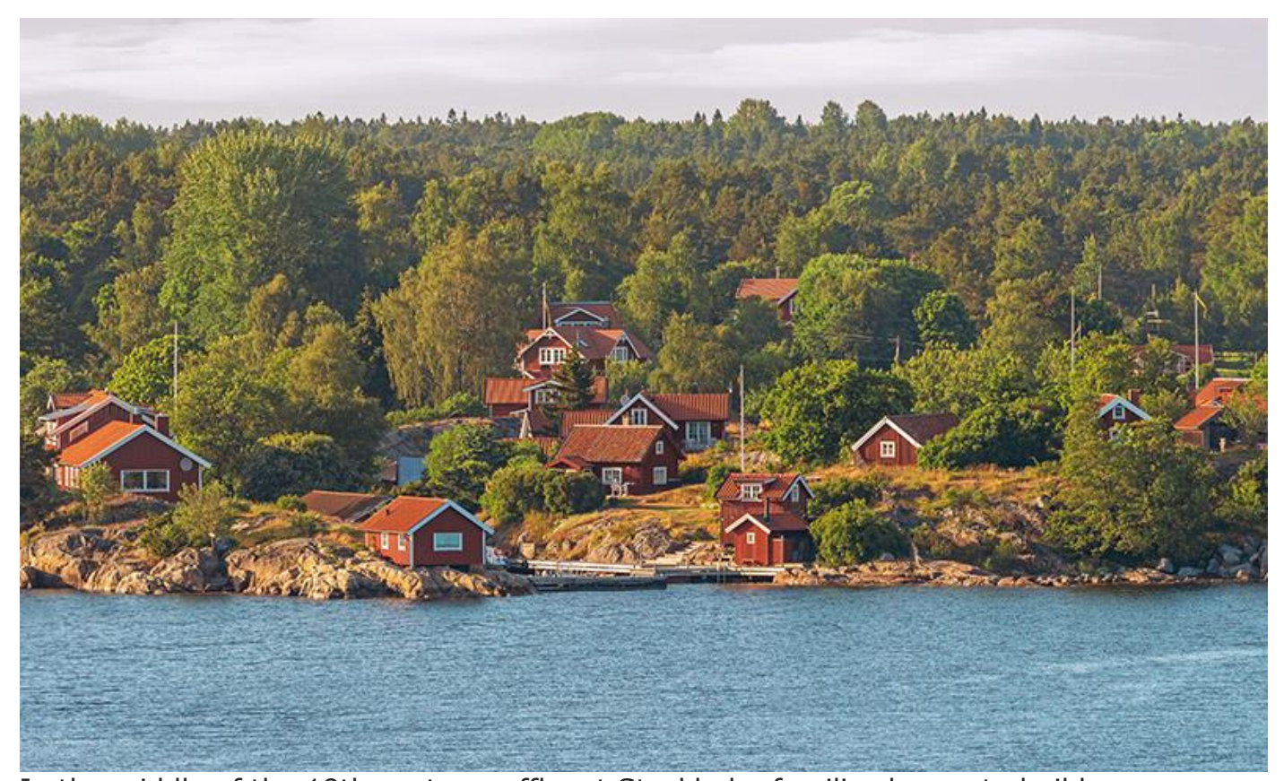
In the middle of the 19th century, affluent Stockholm families began to build their second homes along the shores of the various islands in the archipelago Related: The Stockholm Archipelago

and more lush, the bays and channels wider. Hidden here are idyllic island communities, farmlands and small forests. But as you travel further out, the scenery becomes more rugged. Finally ending in sparse windblown islets formed by the last Ice Age.