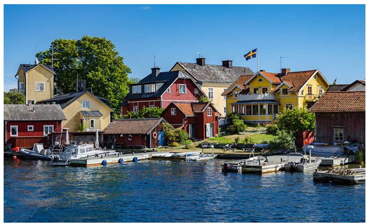
Sandön, with its attractive sailing center village of Sandhamn